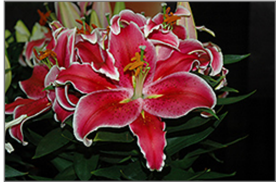
After Eight Lily flowers

A lovely dwarf oriental lily with intensely fragrant blooms that are rose with red tepals edged in white; these beautiful flowers make a spectacular contrast in border plantings and are excellent in containers