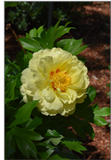
Bartzella Peony flowers