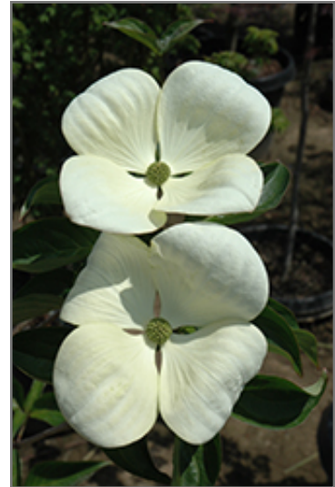
Venus Flowering Dogwood flowers