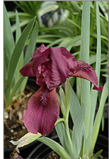
Red Dwarf Bearded Iris flowers