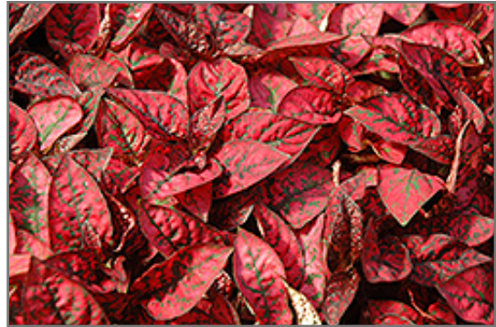
Splash Select Red Polka Dot Plant foliage