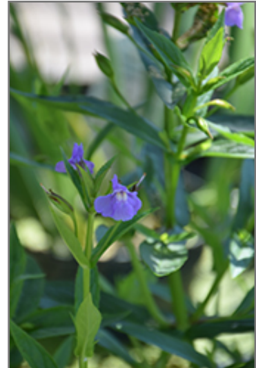
Allegheny Monkey Flower flowers