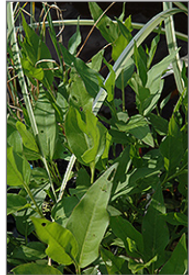
Water Smartweed foliage