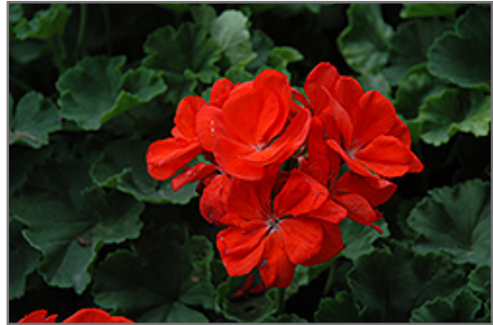
Tango Orange Geranium flowers

Tango Orange Geranium features bold balls of lightly-scented orange flowers at the ends of the stems from late spring to early fall. The flowers are excellent for cutting. Its tomentose round palmate leaves remain green in colour with prominent brown stripes throughout the year.