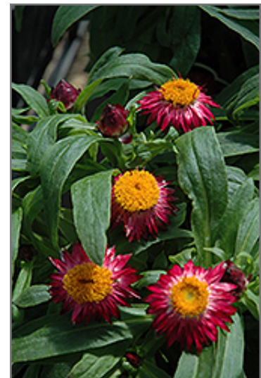
Mohave Dark Red Strawflower flowers