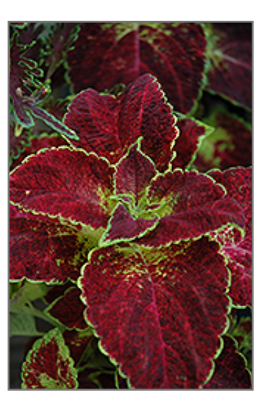
ColorBlaze Dipt in Wine Coleus foliage