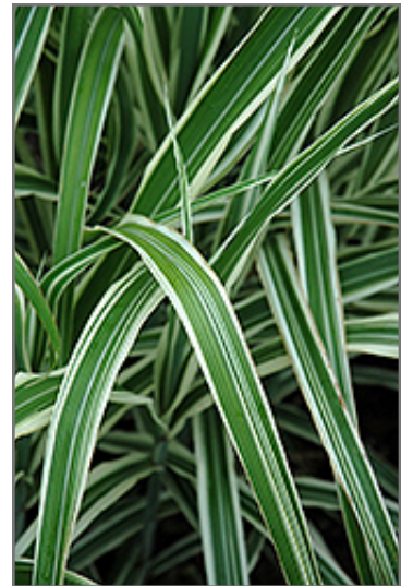
Cosmopolitan Maiden Grass foliage