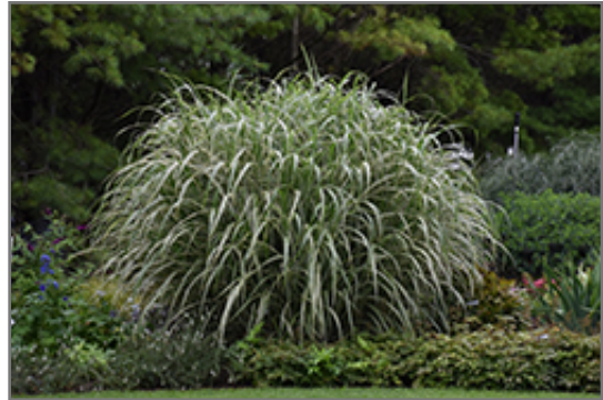
Cosmopolitan Maiden Grass

Cosmopolitan Maiden Grass is recommended for the following landscape applications;