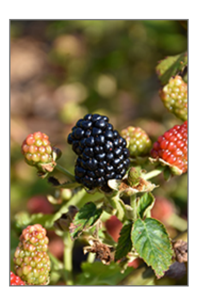
Navaho Thornless Blackberry fruit

Navaho Thornless Blackberry features dainty white flowers with shell pink overtones and chartreuse eyes along the branches in late spring. It has green deciduous foliage. The serrated oval compound leaves do not develop any appreciable fall colour. It features an abundance of magnificent black berries in mid summer.