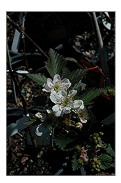
Navaho Thornless Blackberry flowers