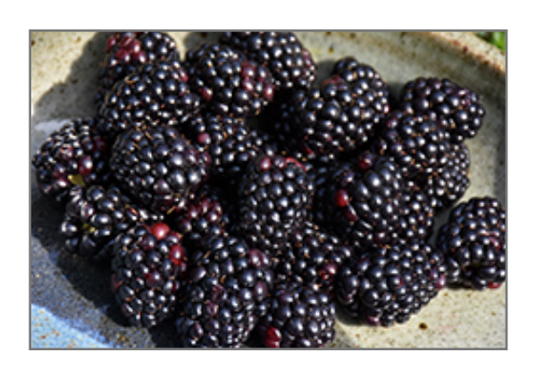
Navaho Thornless Blackberry fruit

This shrub may not always play well with others; as such, it is best grown in its own designated garden space or isolated area of an edibles garden. It should only be grown in full sunlight. It prefers to grow in average to moist conditions, and shouldn't be allowed to dry out. It is not particular as to soil type or pH. It is somewhat tolerant of urban pollution. This particular variety is an interspecific hybrid. It can be propagated by division; however, as a cultivated variety, be aware that it may be subject to certain restrictions or prohibitions on propagation.