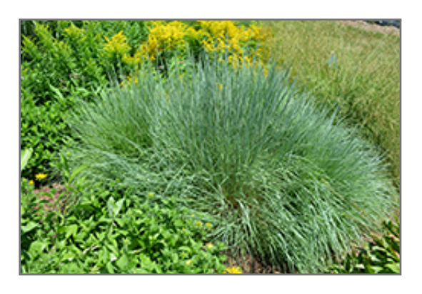
Prairie Blues Bluestem