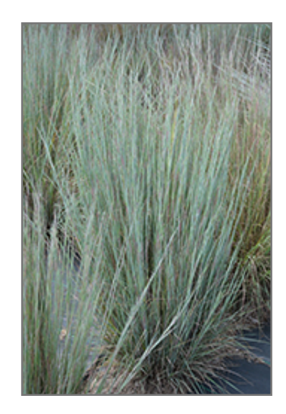
Prairie Blues Bluestem