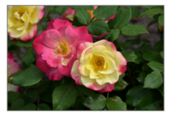
Campfire Rose flowers