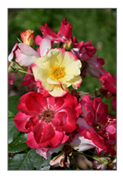
Campfire Rose flowers