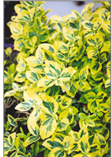
Sungold Wintercreeper foliage