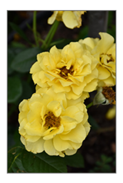
Sparkle And Shine Rose flowers

This shrub should only be grown in full sunlight. It does best in average to evenly moist conditions, but will not tolerate standing water. It is not particular as to soil type or pH. It is highly tolerant of urban pollution and will even thrive in inner city environments. This particular variety is an interspecific hybrid.