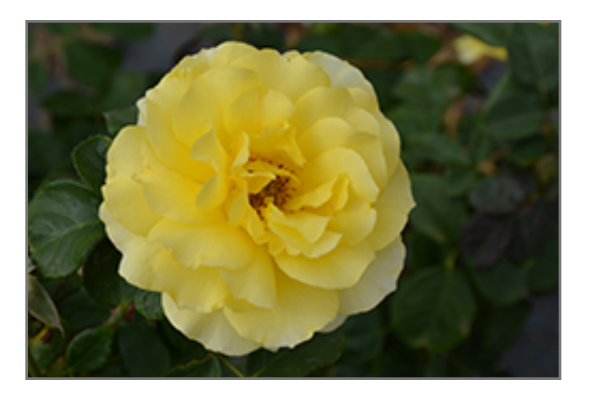
Sparkle And Shine Rose flowers

This shrub will require occasional maintenance and upkeep, and is best pruned in late winter once the threat of extreme cold has passed. It is a good choice for attracting bees to your yard. Gardeners should be aware of the following characteristic(s) that may warrant special consideration;