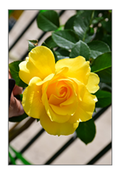
Sparkle And Shine Rose flowers