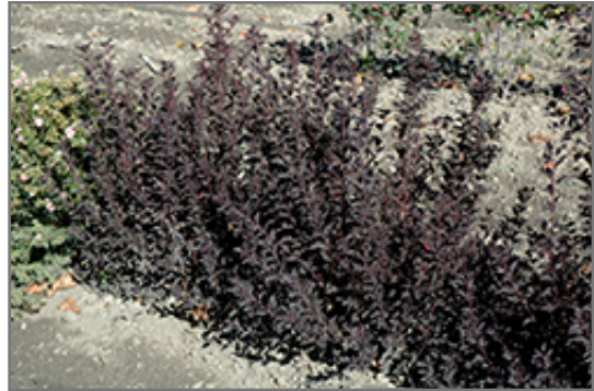
Tiny Wine Ninebark

This shrub does best in full sun to partial shade. It is very adaptable to both dry and moist locations, and should do just fine under average home landscape conditions. It is not particular as to soil type or pH. It is highly tolerant of urban pollution and will even thrive in inner city environments. This is a selection of a native North American species.