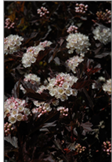
Tiny Wine Ninebark flowers

This shrub will require occasional maintenance and upkeep, and can be pruned at anytime. It has no significant negative characteristics.