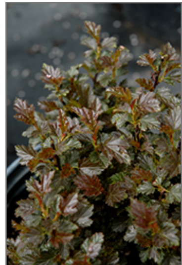
Tiny Wine Ninebark foliage