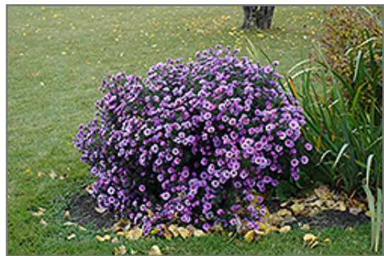
Purple Dome Aster in bloom