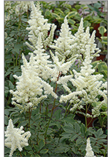
Bridal Veil Astilbe flowers

Bridal Veil Astilbe is recommended for the following landscape applications;