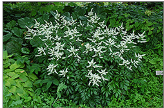
Bridal Veil Astilbe in bloom