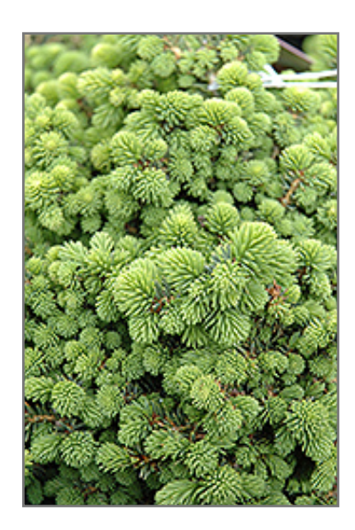
Little Gem Spruce foliage