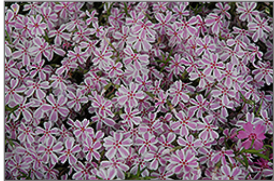
Candy Stripe Moss Phlox flowers

Candy Stripe Moss Phlox is smothered in stunning pink star-shaped flowers with crimson eyes and white stripes at the ends of the stems from early to late spring. Its tiny needle-like leaves remain forest green in colour throughout the year.