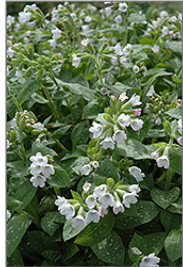
Sissinghurst White Lungwort flowers