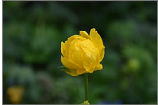
Lemon Queen Globeflower flowers

Lemon Queen Globeflower has masses of beautiful lemon yellow round flowers at the ends of the stems from late spring to early summer, which are most effective when planted in groupings. The flowers are excellent for cutting. Its deeply cut lobed leaves remain dark green in colour throughout the season.