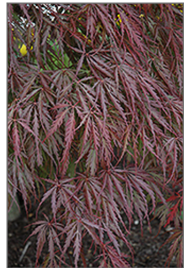
Tamukeyama Japanese Maple foliage