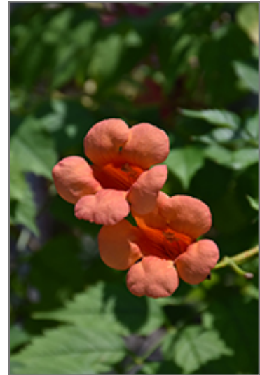
Indian Summer Trumpetvine flowers