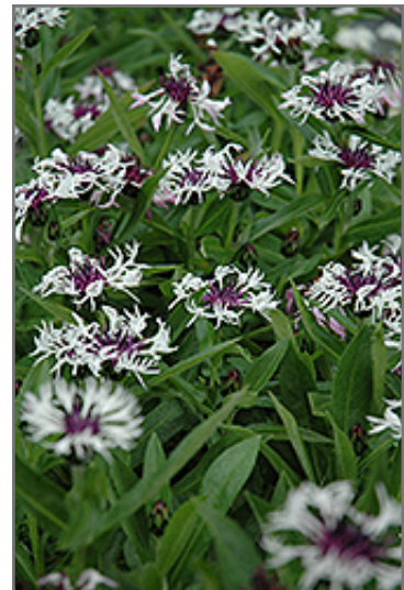
Amethyst In Snow Cornflower flowers