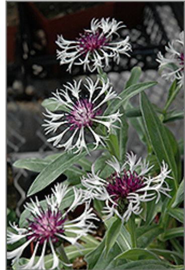
Amethyst In Snow Cornflower flowers