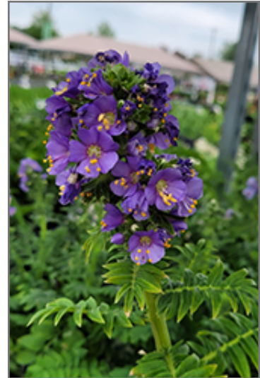
Heavenly Habit Jacob's Ladder flowers