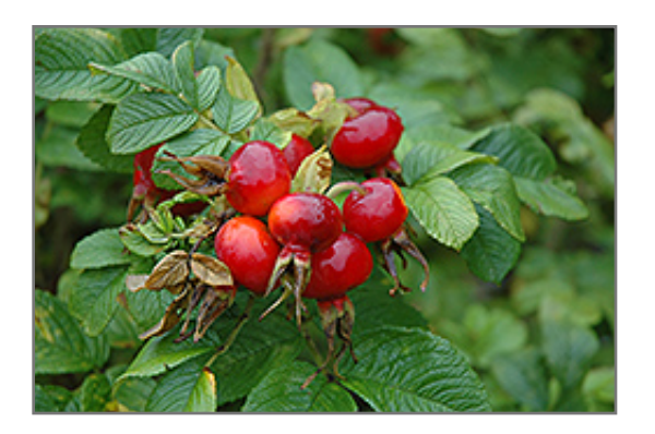
Rugosa Rose fruit

Rugosa Rose will grow to be about 5 feet tall at maturity, with a spread of 7 feet. It tends to fill out right to the ground and therefore doesn't necessarily require facer plants in front, and is suitable for planting under power lines. It grows at a fast rate, and under ideal conditions can be expected to live for approximately 25 years.