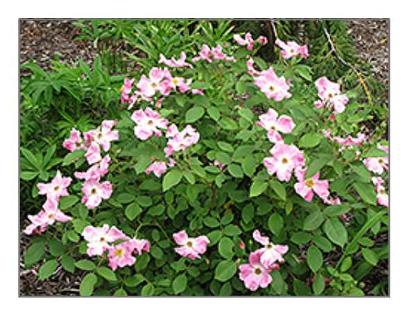
Rugosa Rose in bloom