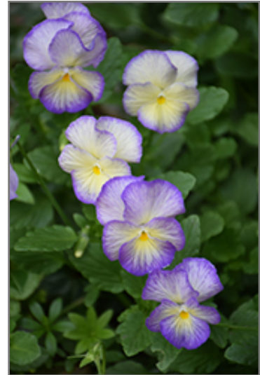
Etain Pansy flowers