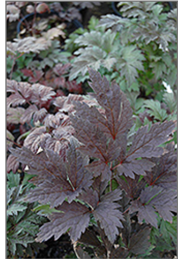
Brunette Bugbane foliage