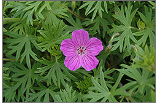
Tiny Monster Cranesbill flowers

This mounded perennial is drenched in saucer shaped violet-purple flowers with dark-purple veins; deadhead spent flowers for reblooming later in the season; foliage takes on scarlet tinges in fall