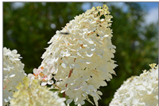
Vanilla Strawberry Hydrangea flowers