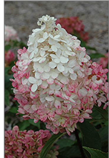
Vanilla Strawberry Hydrangea flowers