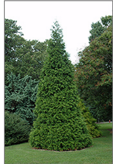
Green Giant Arborvitae

Green Giant Arborvitae will grow to be about 30 feet tall at maturity, with a spread of 10 feet. It has a low canopy, and should not be planted underneath power lines. It grows at a fast rate, and under ideal conditions can be expected to live for 50 years or more.