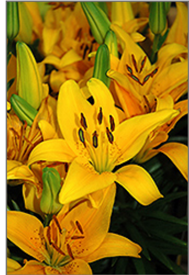
Lily Looks Tiny Bee Lily flowers