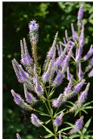
Fascination Culver's Root flowers