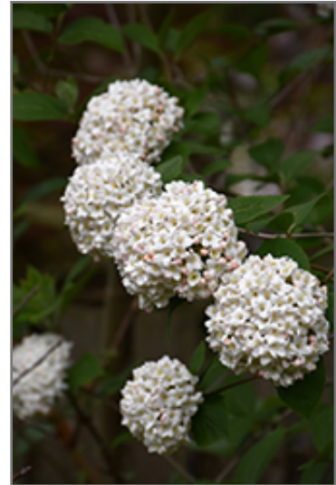
Fragrant Viburnum flowers

Fragrant Viburnum is recommended for the following landscape applications;