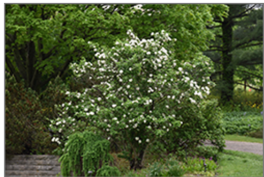
Fragrant Viburnum in bloom