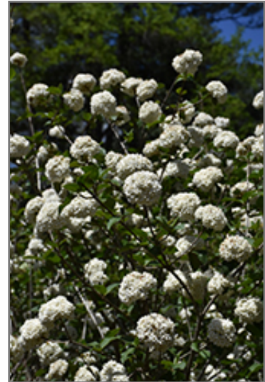
Fragrant Viburnum flowers

This shrub does best in full sun to partial shade. It prefers to grow in average to moist conditions, and shouldn't be allowed to dry out. It is not particular as to soil type or pH. It is highly tolerant of urban pollution and will even thrive in inner city environments. This particular variety is an interspecific hybrid.