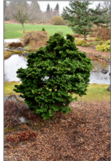
Dwarf Hinoki Falsecypress

Dwarf Hinoki Falsecypress will grow to be about 4 feet tall at maturity, with a spread of 4 feet. It tends to fill out right to the ground and therefore doesn't necessarily require facer plants in front. It grows at a medium rate, and under ideal conditions can be expected to live for 40 years or more.