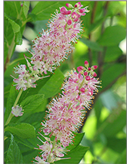
Ruby Spice Summersweet flowers