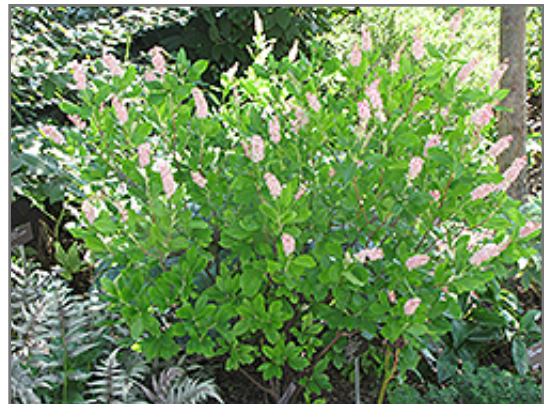
Ruby Spice Summersweet in bloom