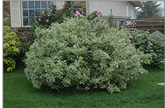
Ivory Halo Dogwood