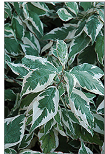
Ivory Halo Dogwood foliage