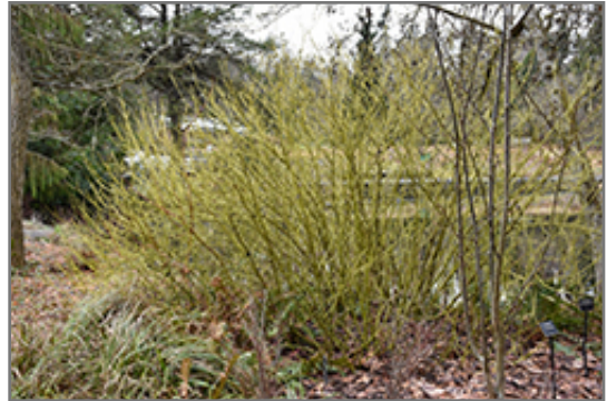
Yellow Twig Dogwood in winter

This shrub does best in full sun to partial shade. It is an amazingly adaptable plant, tolerating both dry conditions and even some standing water. It is not particular as to soil type or pH. It is somewhat tolerant of urban pollution. This is a selection of a native North American species.