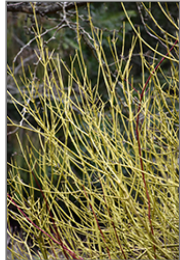
Yellow Twig Dogwood stems

Yellow Twig Dogwood is recommended for the following landscape applications;