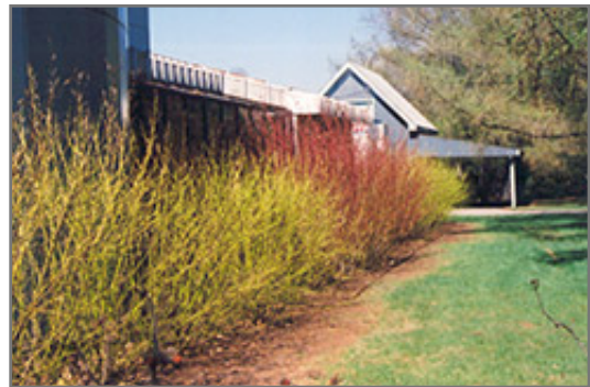
Yellow Twig Dogwood in winter