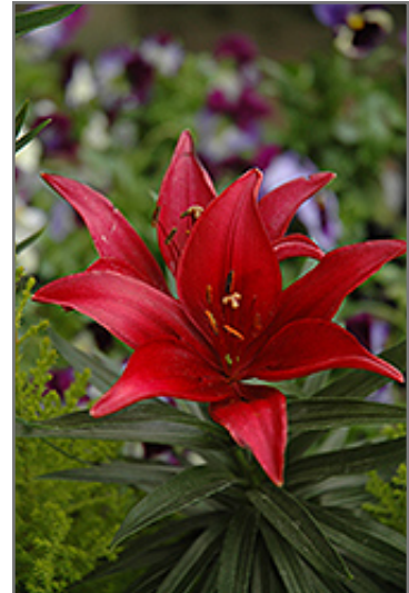
Lily Looks Tiny Ghost Lily flowers