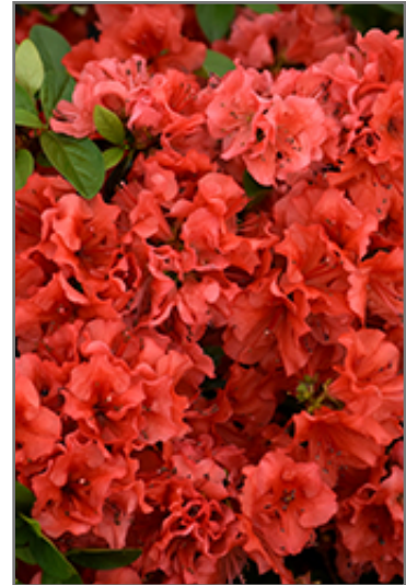
Girard's Hot Shot Azalea flowers

Girard's Hot Shot Azalea will grow to be about 30 inches tall at maturity, with a spread of 30 inches. It has a low canopy. It grows at a slow rate, and under ideal conditions can be expected to live for 40 years or more.