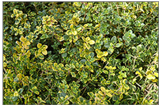
Doone Valley Thyme