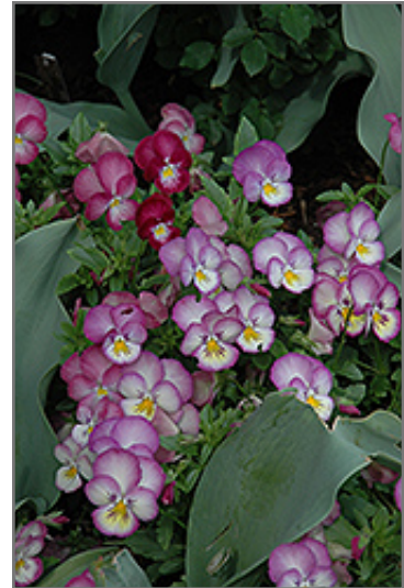
Ultima Radiance Pink Pansy flowers