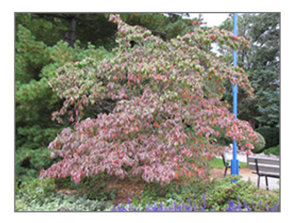
Chinese Dogwood in fall

This tree does best in full sun to partial shade. It does best in average to evenly moist conditions, but will not tolerate standing water. It is very fussy about its soil conditions and must have rich, acidic soils to ensure success, and is subject to chlorosis (yellowing) of the foliage in alkaline soils. It is somewhat tolerant of urban pollution, and will benefit from being planted in a relatively sheltered location. Consider applying a thick mulch around the root zone in winter to protect it in exposed locations or colder microclimates. This species is not originally from North America.