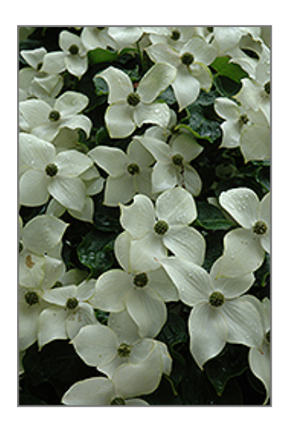
Chinese Dogwood flowers