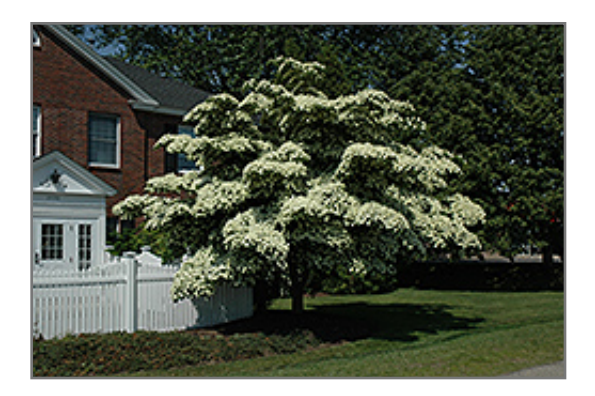
Chinese Dogwood in bloom

This is a relatively low maintenance tree, and should only be pruned after flowering to avoid removing any of the current season's flowers. It is a good choice for attracting birds to your yard. It has no significant negative characteristics.