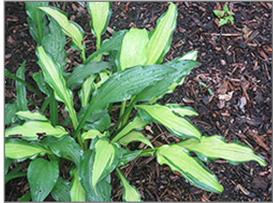
First Mate Hosta