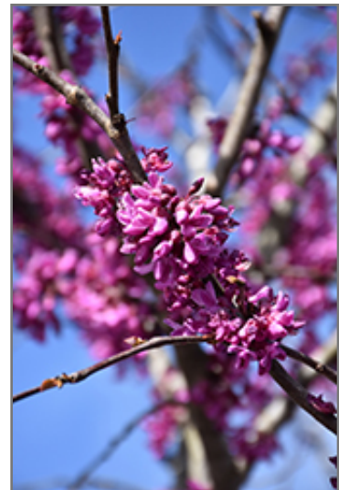
Eastern Redbud (tree form) flowers