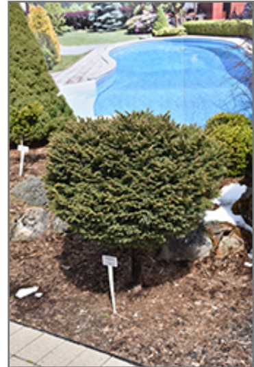
Little Gem Spruce (tree form)