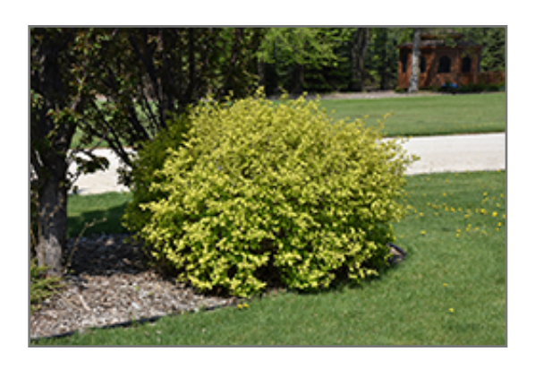
Nugget Ninebark