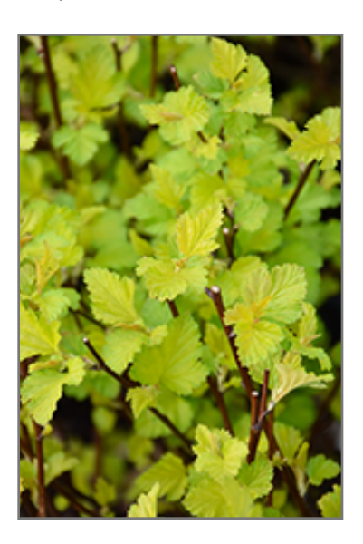
Nugget Ninebark foliage