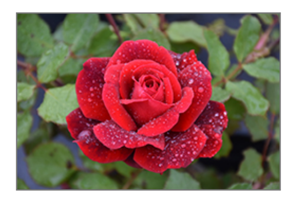
Don Juan Rose flowers

Don Juan Rose is recommended for the following landscape applications;