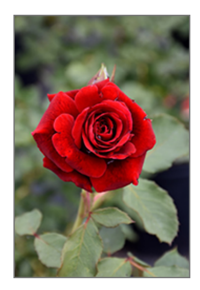
Don Juan Rose flowers